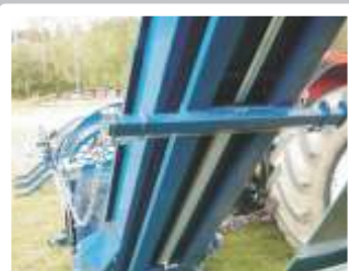
Discharge conveyor (4m):

RCA 380 has a length limiter to be set from 25-50 cm at 5 cm stages. During the infeed process, the length limiter plate approaches the log to be cut for approx. 5 cm and returns to its initial position after the infeed process is completed. This is to ensure the cut log to fall into the chute correctly without interfering with the sawbar.