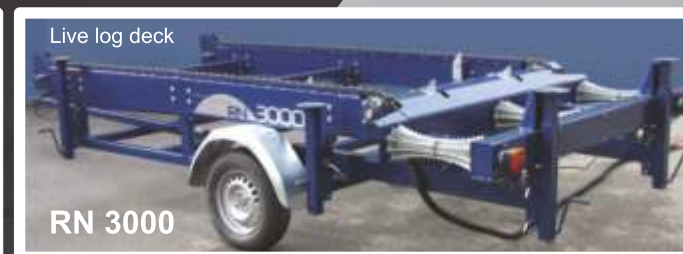
Live log deck RN 3000

Live log deck RN 3000 gives you continuous and efficient log access for your firewood processor to make the complete operation of log processing smoother and the processor more productive.