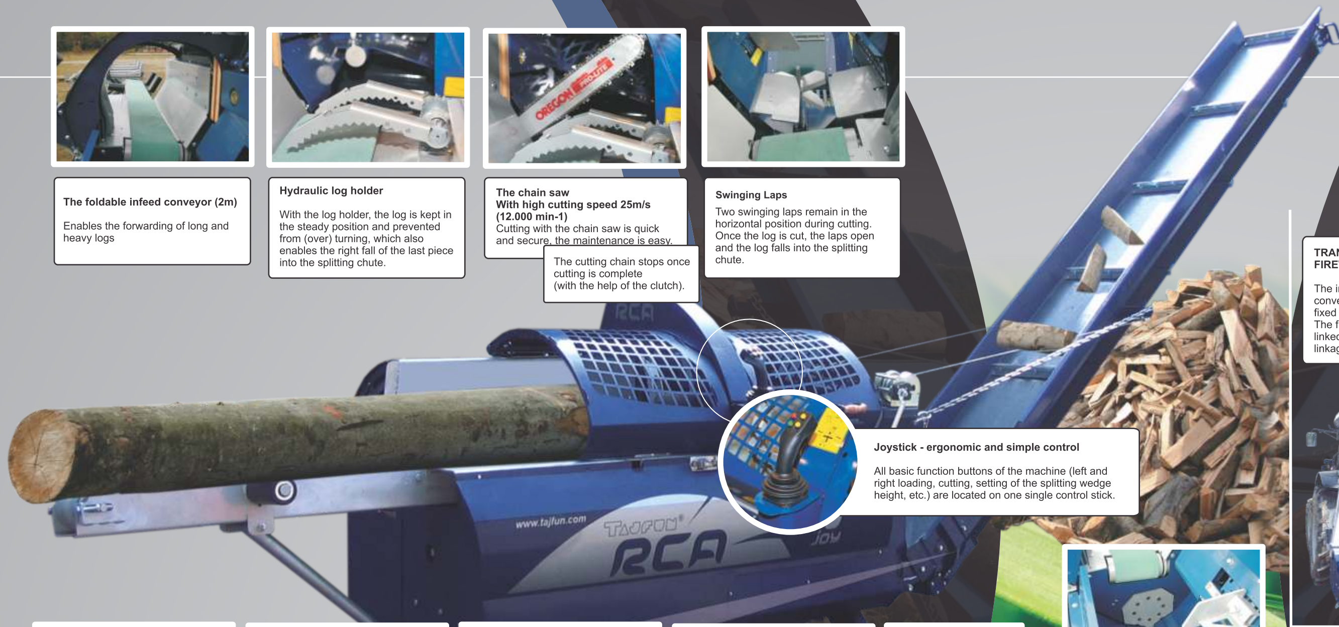
Joystick - ergonomic and simple control

Two swinging laps remain in the horizontal position during cutting. Once the log is cut, the laps open and the log falls into the splitting chute.