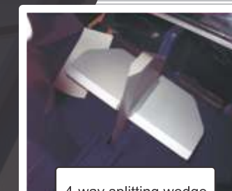
4-way splitting wedge