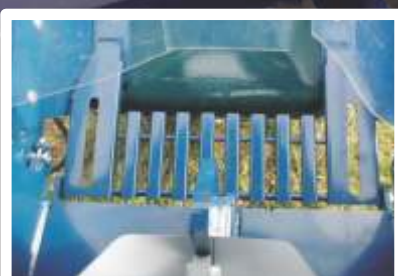
Lattice for sawdust

Option-RCA 400 joy TG with the slewing discharge conveyor The conveyor has the possibility to move at an angle of 15° to the left and to the right, which enables filling of three pallets.