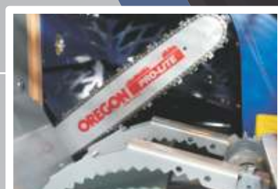
The chain saw With high cutting speed 25m/s (12.000 min -1 )

With the log holder, the log is kept in the steady position and prevented from (over) turning, which also enables the right fall of the last piece into the splitting chute.