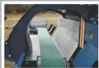
The foldable infeed conveyor (2m)

Enables cutting logs with a diameter of up to 40 cm and the splitting of sawn logs to a length of between 25 to 50 cm.