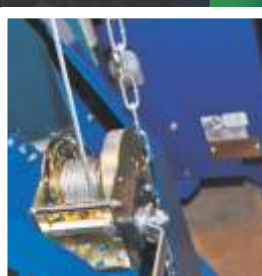
Conveyor lifting /lowering winch

between the splitting wedge and conveyor.