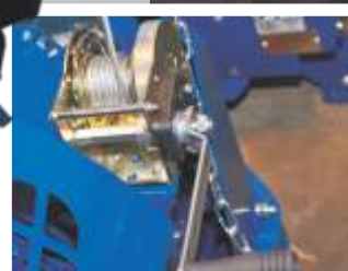
Conveyor lifting /lowering winch

between the splitting wedge and conveyor.