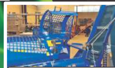
Main Cover With the opening of cover all basic functions stop.