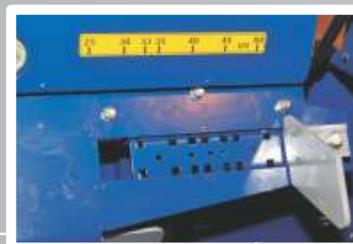
Hydraulic Length Limiter

The length limiter is set from 25-50 cm at 5 cm stages.