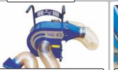
Sawdust extractor fan XE 10 Motor: 1,1 kW, 230 V; 2.800 min -1