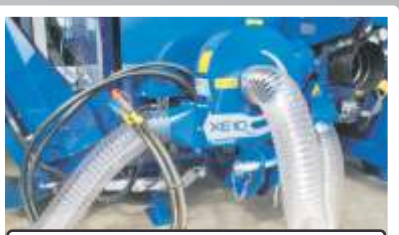
Sawdust extractor fan XE 10 Hy