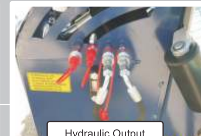
Hydraulic Output for DM or RN