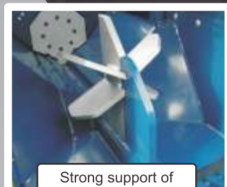
Strong support of splitting wedge

The height of the splitting wedge is adjusted with the holder to best fit the size of the cut log.