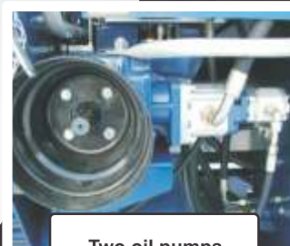
Two oil pumps