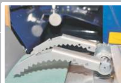
Hydraulic log holder

Enables the forwarding of long and heavy logs