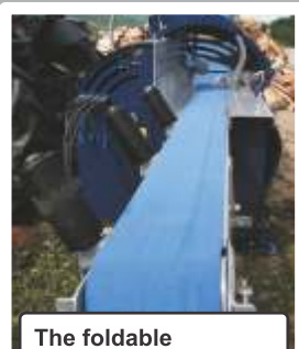
The foldable infeed conveyor - 2 m

Enables cutting logs with a diameter of up to 25 cm and the splitting of sawn logs to a length of between 25 to 50 cm.