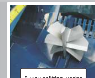
8-way splitting wedge