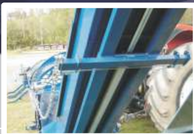
Discharge conveyor (4m):

two stage telescope with automatic hydraulic belt straining. Continuous speed control of the conveyor belt. Adjustable conveyor speed button - on the operator's side