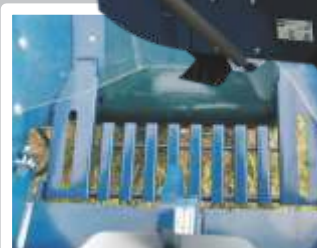
Lattice for sawdust

two stage telescope with automatic hydraulic belt straining. Continuous speed control of the conveyor belt.