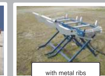
with metal ribs