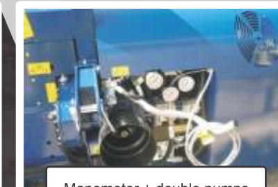
Manometer + double pumps