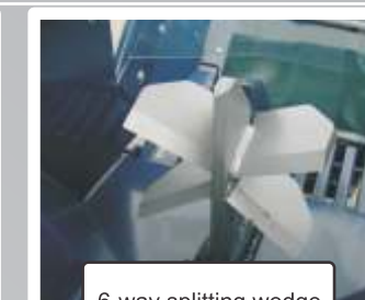
6-way splitting wedge