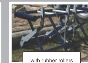
with rubber rollers