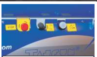
Controls for log loader or RN, conveyor belt; STOP function