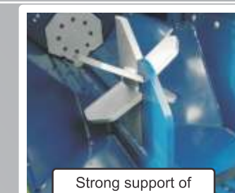
Strong support of splitting wedge